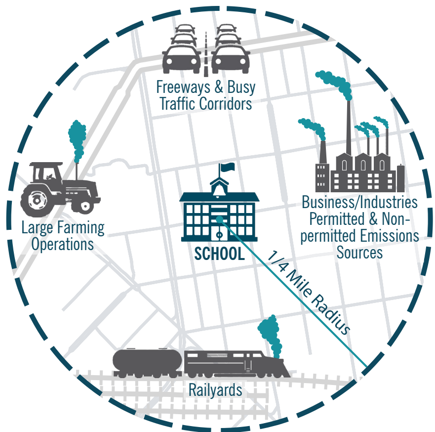
Figure 1. Exposure to Toxins (Chronic, Long-Term Exposure)

Anyone who has processed a school project is familiar with requirements for school sites within a quarter mile of facilities that emit hazardous air emissions or handle acutely hazardous materials, substances, or waste. These facilities are identified through agencies that maintain hazardous materials inventories (such as the fire department or health department) and the air quality district. The air district's database identifies "permitted" facilities—i.e., facilities that have a permit for air emissions—within a quarter mile of school sites. However, permit data does not always reflect actual conditions, and not surprisingly, agency databases do not include facilities for which they have not issued permits. Nevertheless, nonpermitted facilities must also be identified. A field survey of the project vicinity and interviews for all facilities with the quarter-mile radius should be completed to identify nonpermitted facilities and verify permit data. Facilities should be added and subtracted as appropriate (see Figure 1).